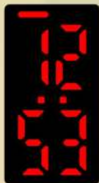
Charging in progress The icon in the upper left corner flashes