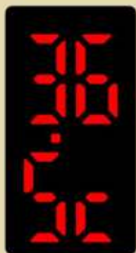
Normal body temperature