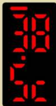
Abnormal body temperature The icon in the upper left corner flashes